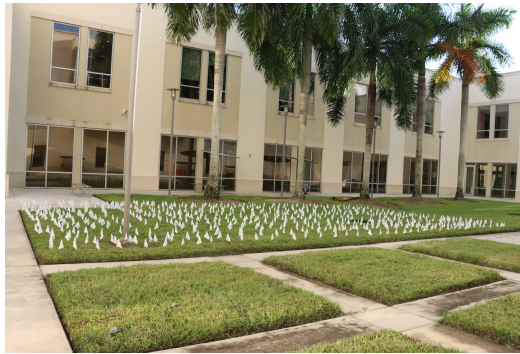
599 white flags representing Cuban political prisoners who remain incarcerated following the events of July 11th, 2021